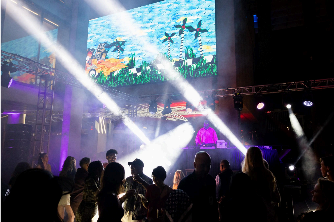
PAMM Presents 2024.

(MIAMI, FL — December 12, 2024) — Last week, Pérez Art Museum Miami (PAMM) celebrated Miami Art Week 2024 with an exciting lineup of events and exhibitions with highlights including the museum's signature Art Week party, as well as their annual donor dinner, and a panel discussion with Kate Capshaw. In addition to programming and festivities, PAMM announced institutional acquisitions from The New Art Dealers Alliance (NADA) and SCOPE Art Show.