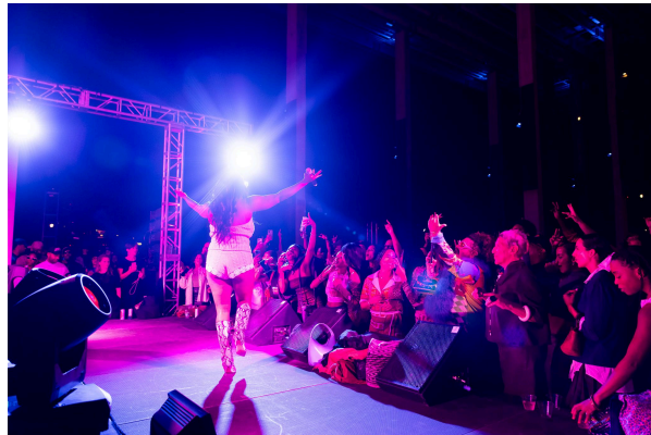
PAMM Presents 2024. Left: Right