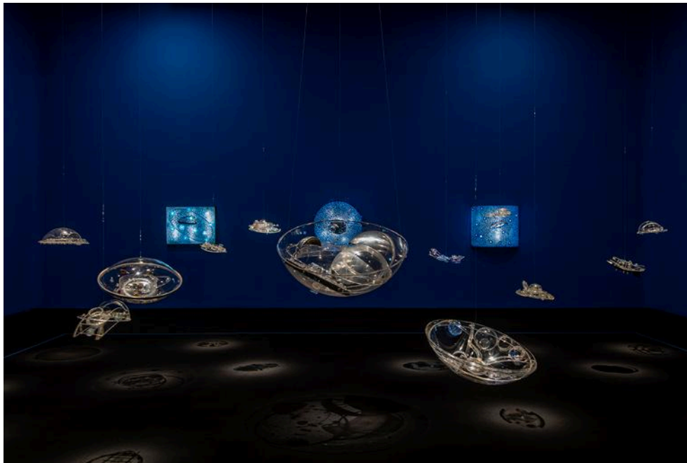
Installation view: Gyula Kosice: Intergalactic, Fundación Malba, 2024.